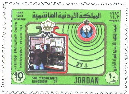
Jordanian Ham Stamp with JY1