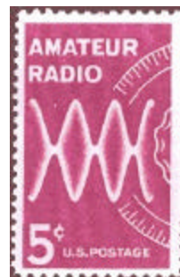
US Ham Stamp