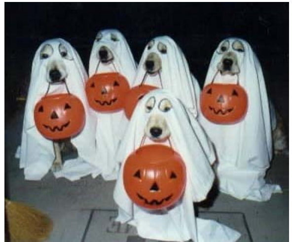
Have a Safe & Happy Halloween