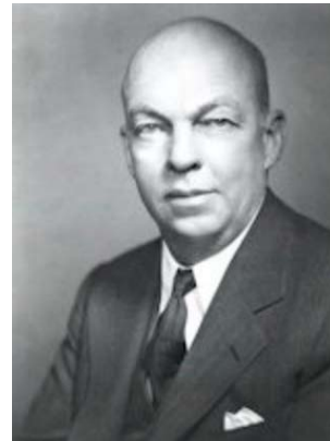
Major Armstrong: Inventor, Ham, Patriot

We radio amateurs (and the rest of the world, for that matter), owe a great debt of gratitude to this month's Dead Electrical Dude, Major Edwin Howard Armstrong. Howard's inventions form the basis for all modern radio communications devices. Indeed, the list of Howard's accomplishments is impressive. Unfortunately, Howard spent the latter part of his life in endless patent battles.